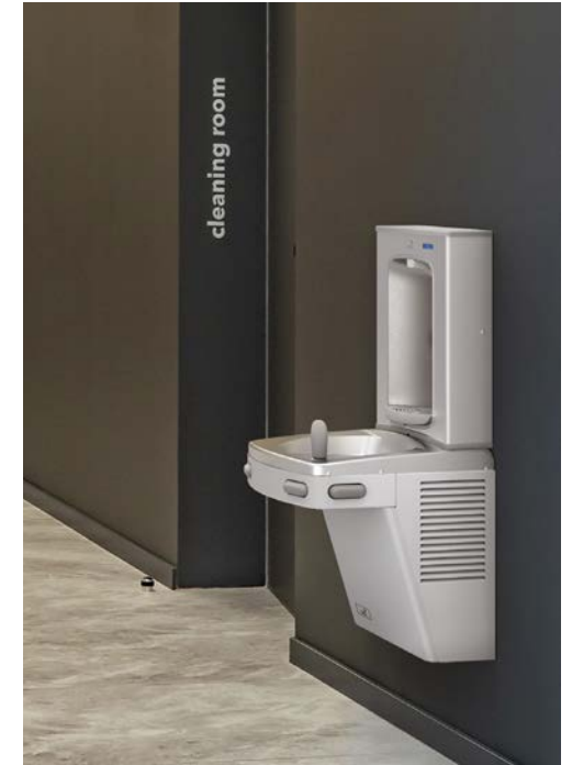
DRINKING FOUNTAINS + BOTTLE FILLERS

Oasis is the worldwide leader of water-friendly solutions. We design and manufacture an array of product, specialising in bottled + mains-fed watercoolers, bottle fillers, drinking fountains; with technologies to filter and disinfect water for the safest hydration.